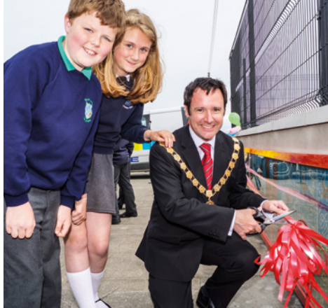
Mayor Stephen McIlveen with P7 pupils from Kirkistown PS and St Patricks Ballygalget PS who did the artwork for the tile mural.

This art project was a joint cross-community exercise. Individual tiles with local themes were designed by pupils from the 2 primary schools (Kirkistown and St Patrick's Ballygalget). The tiles were then mounted in a mural on the outside wall of the pumping station opposite the Primary School – a lasting legacy.