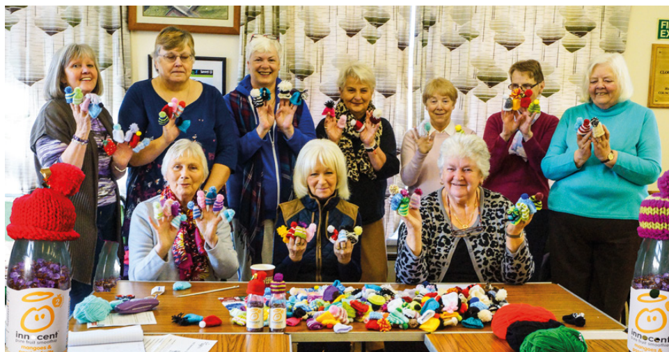
Knit & Natter Group