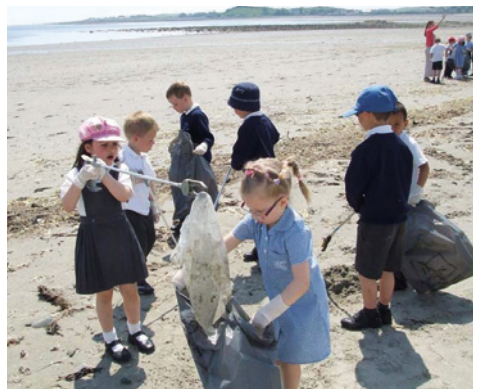
Local schools helping to clean up the Beach

Once these main litter picks have been done, the Cloughey Beach Care Group take over and continue all year round to gather litter on different parts of the beach on a regular basis, keeping the beach looking pristine between the big beach clean events.