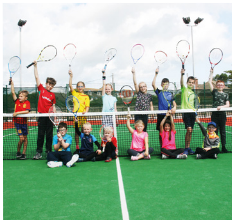
Cloughey Tennis Club in Action

It is difficult for newly-formed groups to obtain grant funding as they have to tick a lot of boxes and to be properly constituted with insurance and bank account. CDCA has acted as an umbrella organisation applying for grants to get these other groups off the ground and, when successful, assisting them in becoming independent and viable. All of these groups stimulate social cohesion, and add to the sense of Community in Cloughey & District.