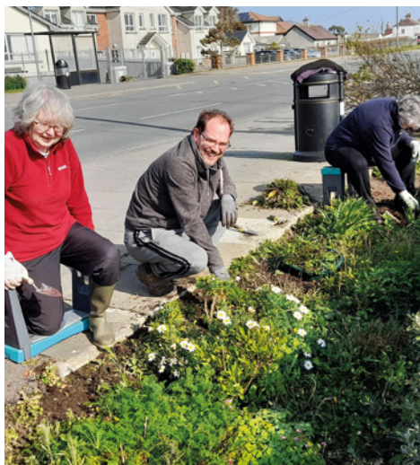
CDCA community garden created from rough waste ground beside playground, looks good all year round.